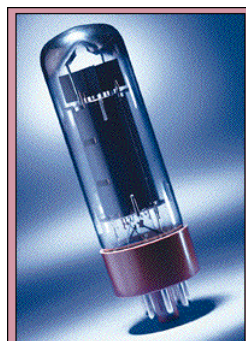
Widely used in guitar amplifiers, the octal-based Svetlana EL34 power pentode features a graphite-coated screen grid and a gold-plated control grid.